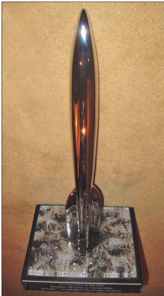
Renovation's Hugo base. How will Chicon 7's look?